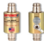
Lightning Arrestor LABH350NN (Sold Separately)