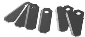
REPLACEMENT BLADES (6 PER PACKAGE) RFA-4087-R14