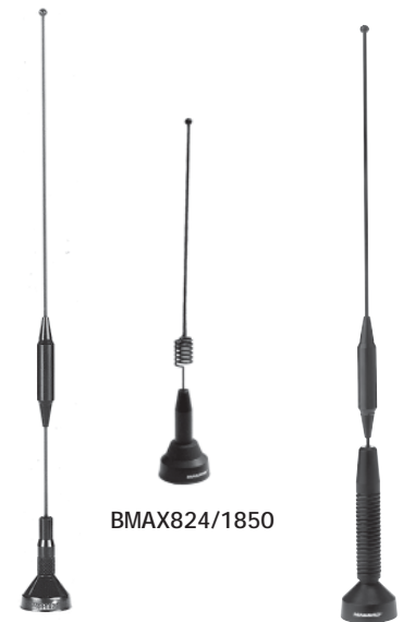
(B)MAXSCAN1000 BMAX824/1850 BMAX8155S