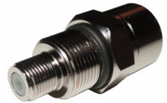
ICHBAFFKS/2 BAFF Cap, Converts existing Pin connector to F Female