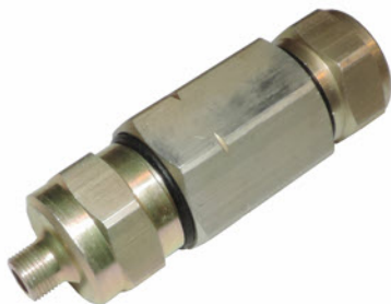
CT-TLC-500-BAFF-03 .500 To F Female Adapter