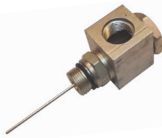
CT-TLC-90 90 Degree Hardline Adapter