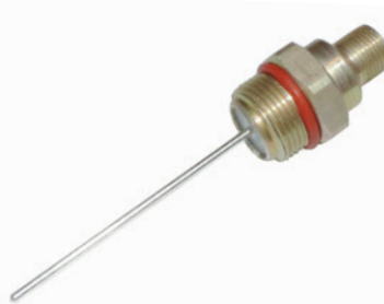
CT-TLC-625-CH-S Pin To F Female Adapter