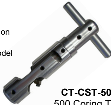
CT-CST-500 .500 Coring Tool