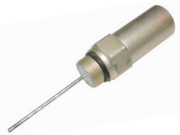
CT-TLC-M Hardline Housing Terminator