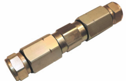
CT-TLC-500-SP-DU-03 .500 In Line Splice