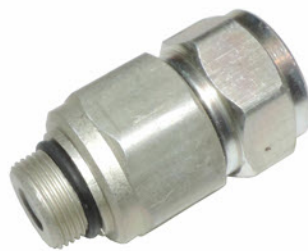
CT-TLC-500-B-DU-03 .500 Feed Through Connector