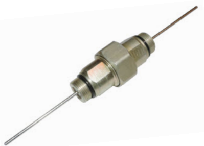
CT-TLC-KS-KS-M Housing To Housing Adapter