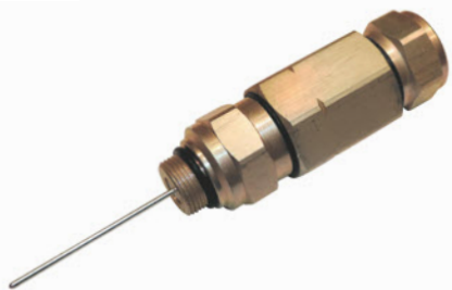
CT-TLC-500-CH-DU-03 .500 Pin Connector